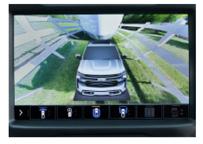
Bowl View <sup>1</sup> Provides a rear-facing 3-D surround view, useful for low-speed backing maneuvers.