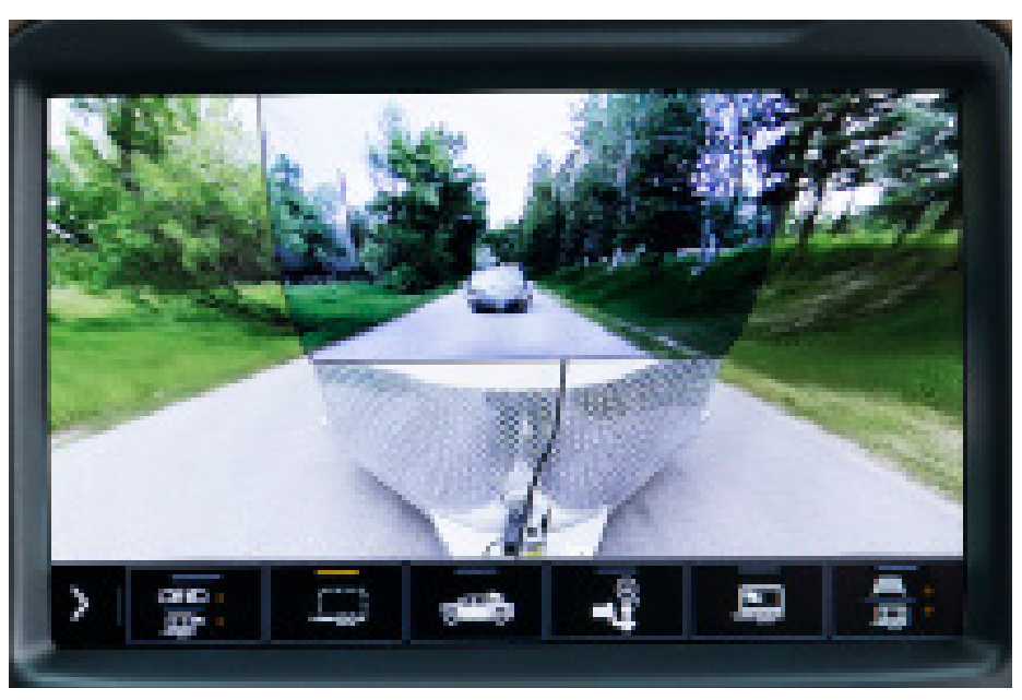
Trailer Camera - Silverado LTZ Premium Only