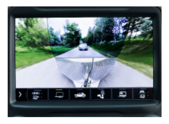
Transparent Trailer View <sup>2</sup> Allows the driver to virtually "see through" a compatible trailer.