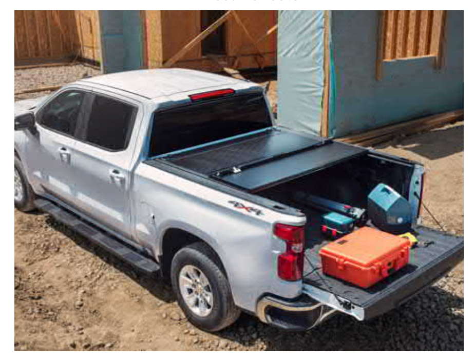
Tonneau - Trifold