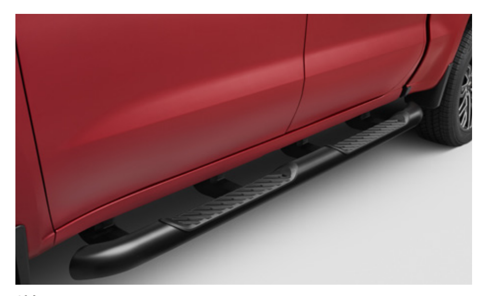
Sidestep Available in Black or Chrome