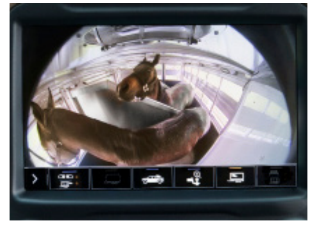
Inside Trailer View<sup>2</sup> Allows the driver to monitor trailer contents or cargo using an available Accessory Camera that can be installed in the trailer.