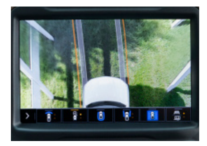
Front Top-Down View<sup>1</sup> Provides a top-down view of the hood, bumper and front tires for tight maneuvers in parking lots or along curbs. Includes guidelines that can be turned on or off as necessary.