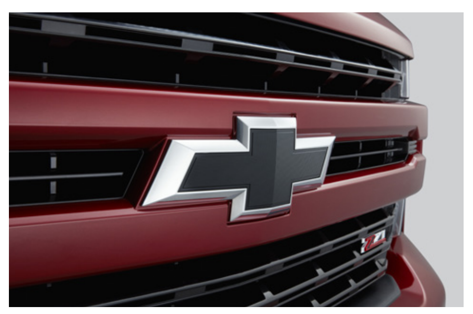
Black Front Bow Tie Badge