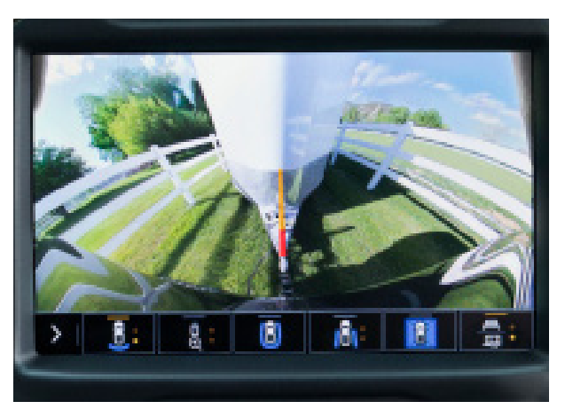
Rear Camera View Displays a view behind the truck with available guidelines to assist with parking and tight maneuvers or to hitch a trailer.