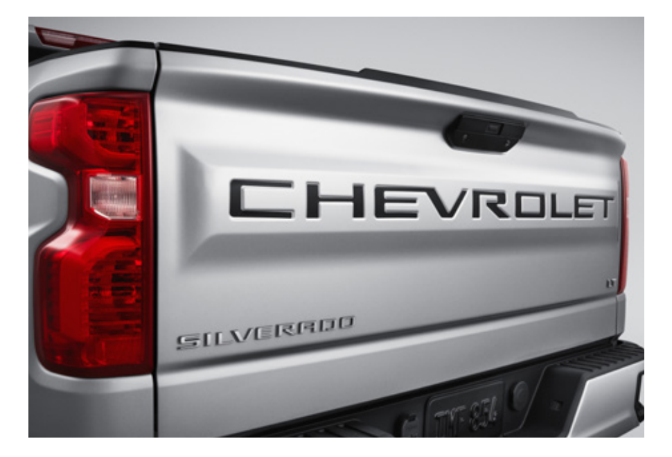
Personalised Black Lettering Combinations Black Chevrolet Lettering Tailgate or Black Lettering Kit