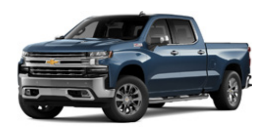
METALLIC NORTH SKY BLUE<sup>1</sup>