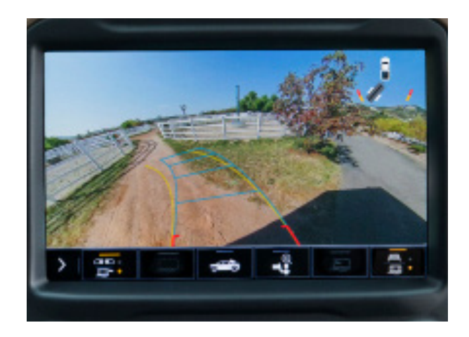
Rear Trailer View<sup>2</sup> Uses an available accessory camera to show objects behind a compatible trailer. Trailer Angle Indicator<sup>2</sup> with Trailer Guidelines<sup>2</sup> shows your current path. A second set of guidelines shows