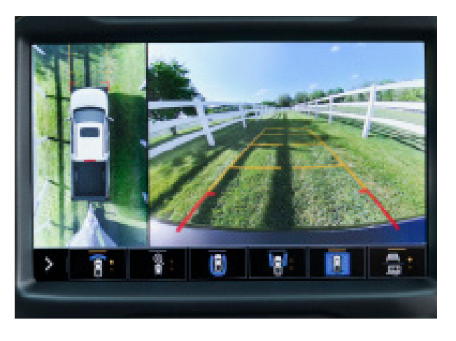
Surround View <sup>1</sup> Gives a top-down bird's-eye view of the truck's surroundings.