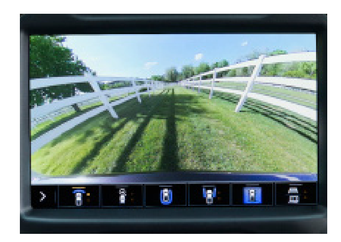
Front Camera View<sup>1</sup> Displays a view in front of the truck with available guidelines to assist with parking and tight maneuvers.