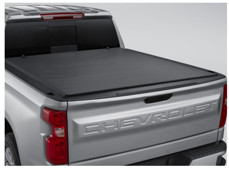
Soft Roll-Up Tonneau Cover