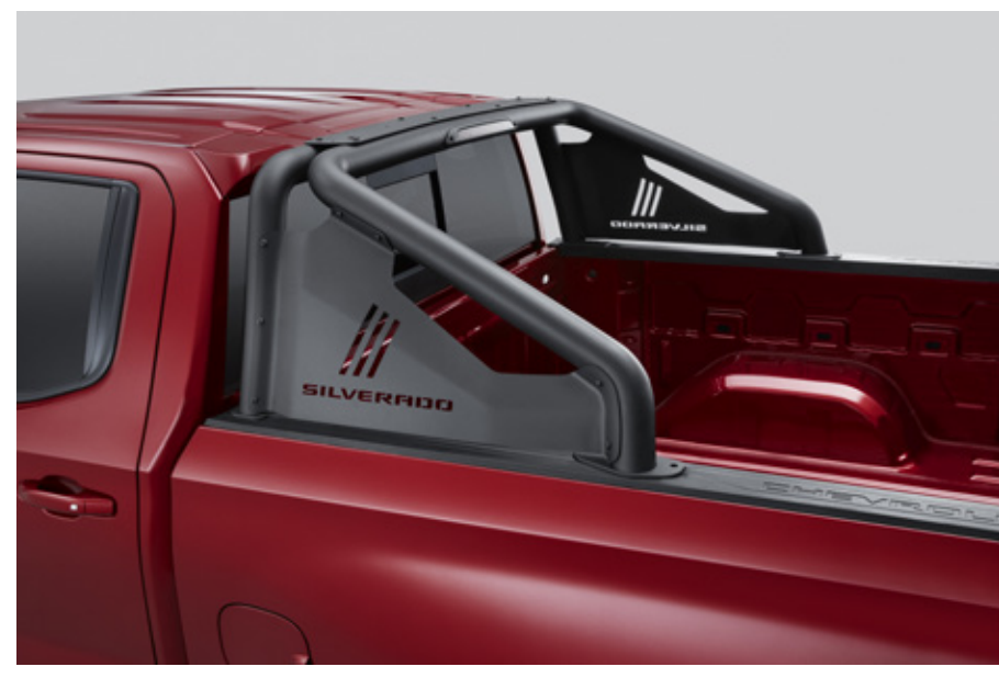
Sports bar - Silverado LT Trail Boss Only