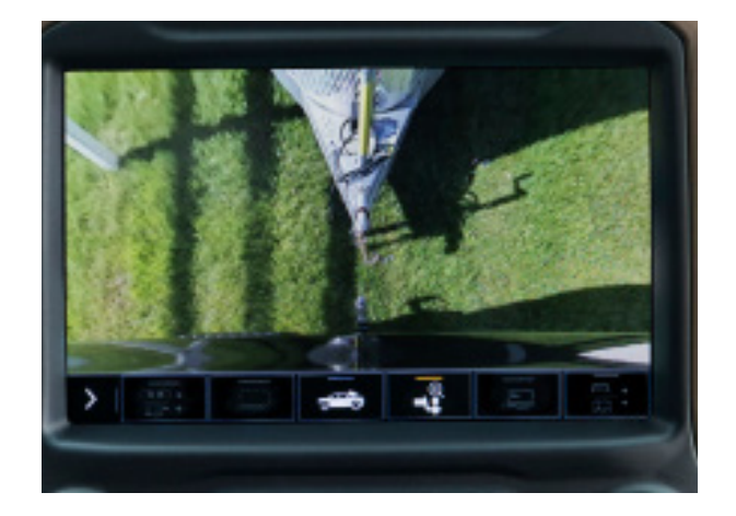
Hitch View <sup>1</sup> Provides a close-up view of the receiver hitch to help with alignment when connecting to a trailer.