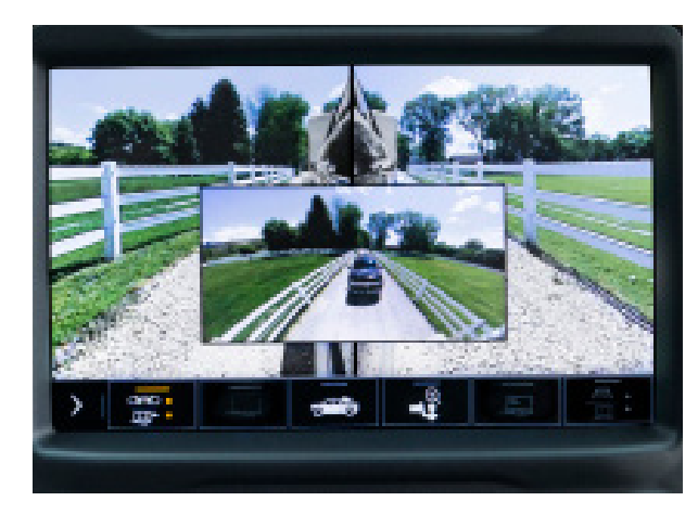
Pic-In-Pic Side View <sup>2</sup> Combines two views — the Rear Side View and the Rear Trailer View. Requires available Accessory Camera.