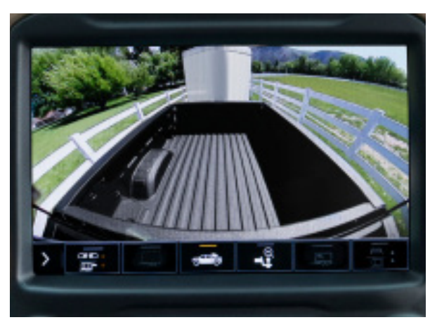
Bed View <sup>1</sup> Allows you to see the cargo bed to help with fifth-wheel or gooseneck hitching or to briefly check on cargo.