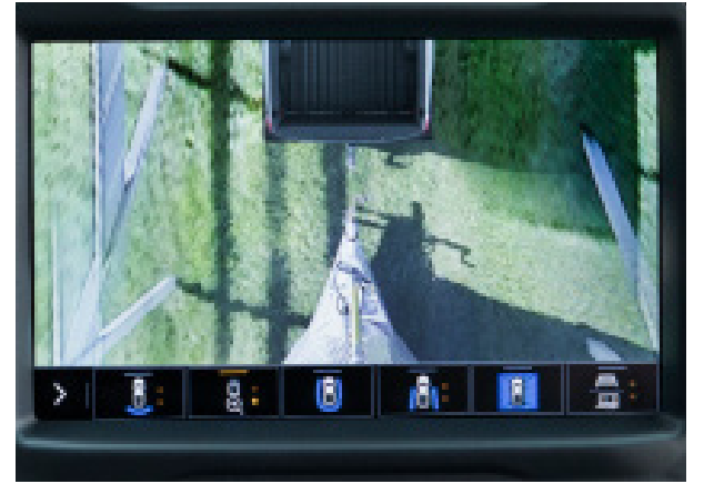
Rear Top-Down View <sup>1</sup> Shows the clearance between the truck bed and nearby objects.