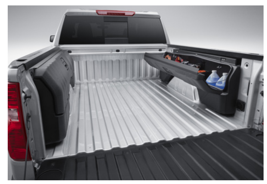
Tub Boxes - Side Mounted